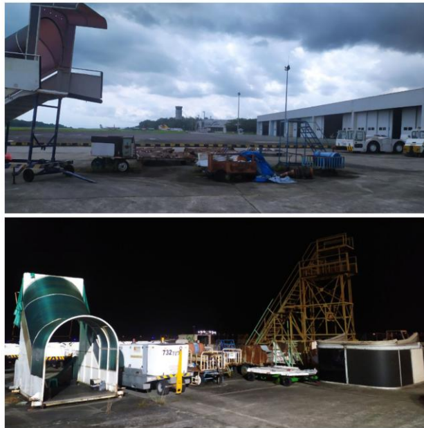
Figure 4 Storage B Condition