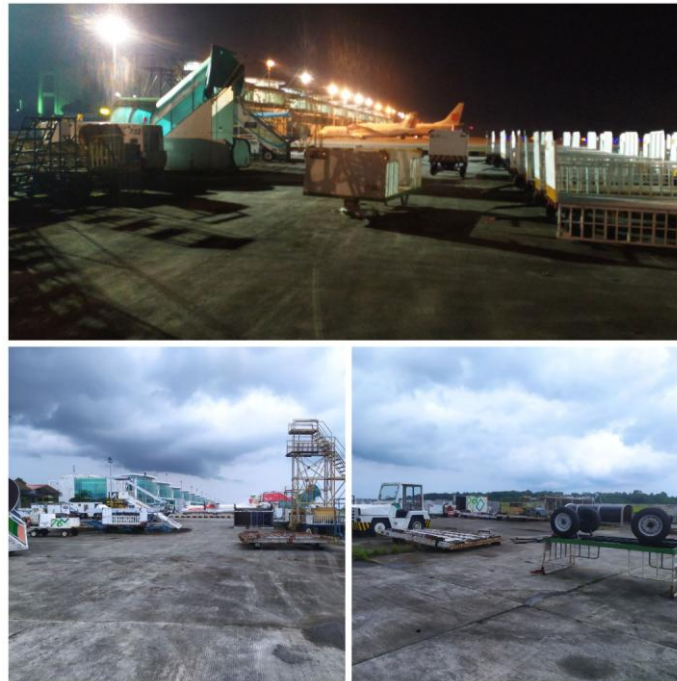
Figure 3 Storage B Condition

From the author's observations, the number of operational Motorized and Non-Motorized GSE, and the total area of Equipment Storage Area (ESA) available at Sultan Aji Muhammad Sulaiman Sepinggan International Airport Balikpapan were obtained.