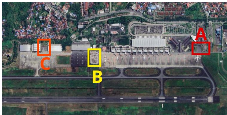
Figure 1 SAMS Sepinggan Airport Ground Support Equipment Layout[3]

With the increasing flight operations at Sultan Aji Muhammad Sulaiman Sepinggan Balikpapan International Airport, ground handling services must be executed optimally to meet performance standards for efficiency, timeliness, and flight safety. Ground handling encompasses activities performed by companies related to aircraft and passenger services, including baggage handling, ticketing, and Ground Support Equipment (GSE) provision to support aircraft services during ground operations. These services are essential for passenger boarding and disembarkation, baggage and cargo loading/unloading, and other critical airport operations [2].