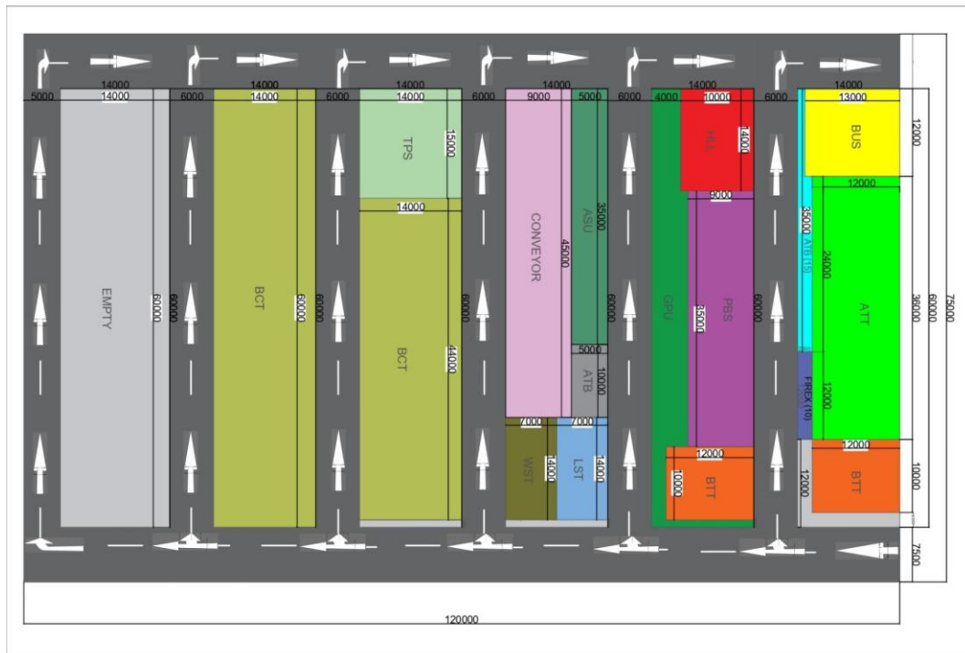
Figure 7 Layout of GSE Placement

The implementation of markings should also be complemented by a GSE layout that considers equipment traffic, the position of access and exit to the apron. Thus, the management of the Equipment Storage Area (ESA) will be more safety, efficient, and meet the applicable regulatory standards. The following layout is made by the researcher as a suggestion for GSE layout in storage B at Sultan Aji Muhammad Sulaiman Sepinggán Balikpapan International Airport :