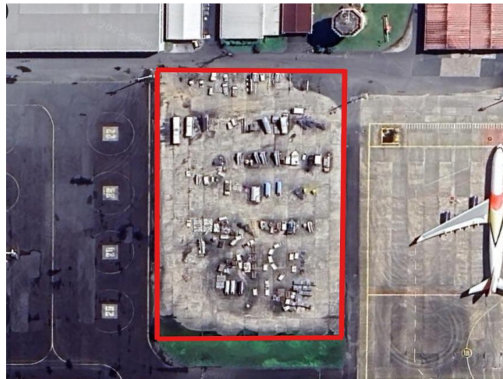
Figure 5 Storage B Condition [3]

The author's observations indicate that the placement of Ground Support Equipment (GSE) in Storage B still does not meet ideal operational order and safety standards. The primary factor causing this condition is the absence of equipment storage markings, which serve as clear boundary indicators for the GSE storage area. Markings play a very important function in aviation operations. The lack of markings leads to disorderly and irregular GSE placement, with some GSE even obstructing the traffic flow of other GSE. This condition not only complicates operator access to specific GSE but also creates the potential for incidents and service disruptions.